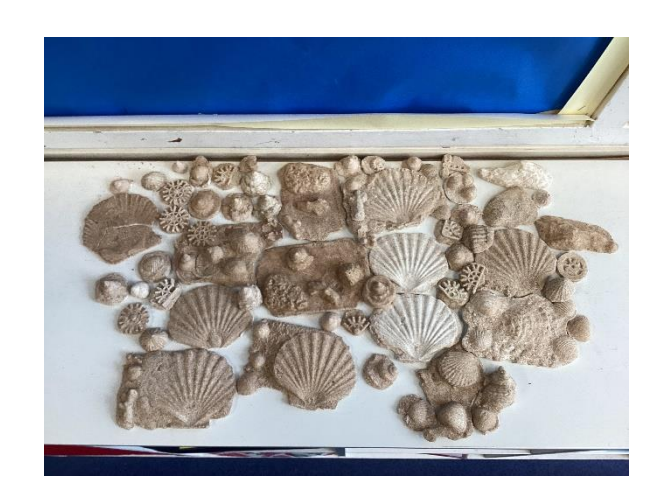
Wiltshire & Whiteread Class